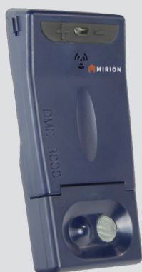
DMC 3000 Beta