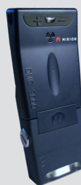
DMC 3000 Neutron Telemetry