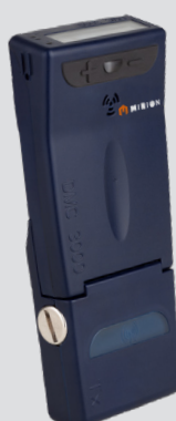
DMC 3000 Telemetry